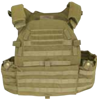
Plate Size: A - Medium (M) B - Large (L) C - Extra Large (XL)

MODULAR LEVEL IV PLATE CARRIER LBT-6094-LEVEL IV (A, B, C)* • Modular web attachment points on entire carrier profile provides maximum versatility • Front, back, and side plate pockets • Quick release tabs on bottom for front and back plate adjustment/removal • Cummerbund for gear stowage and side body armor (6"x6" or 6"x8" hard plates and soft body armor – not included) with concealed rear bungee adjustment • Dual interior side radio pouches with retention. • Adjustable shoulder straps with removable wrap-around pads • Cable, antenna and hydration hose guides • Extra heavy duty reinforced drag handle • Centered front Kangaroo pocket provides quick access to maps, critical gear and mags (will accept LBT-2645A) • Interior loop attachment points for shoulder or collar soft armor • Separate sleeves for soft armor package, hard armor package and CASS • MIL-Spec stitching standards, Type E thread • Weight: 3.1 lbs. ** Armor plates not included** LBT-6094A - Fits small and medium plates LBT-6094B - Fits large plates LBT-6094C - Fits extra large plates * Available in Standard and Swimmers Cut Plates ** Level III-A FRAG soft armor packages available Please contact your LBT sales representative for information